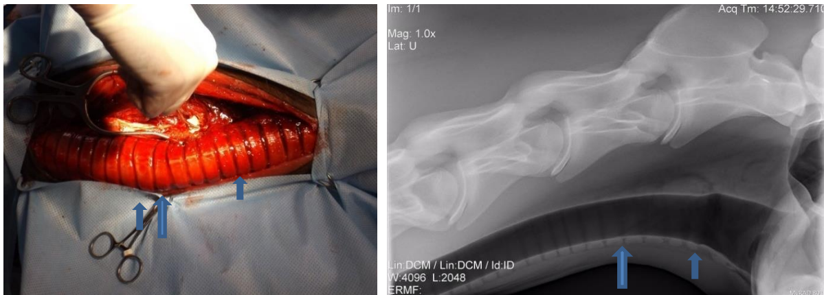
Figures 1 and 2. There is irregularity of the tracheal rings ( blue arrow ).

laryngeal hemiplegia ( May-Davis & Walker, 2015 ), which we did not confirm with upper respiratory video endoscopy, because we did not perform this procedure in all horses in GII.