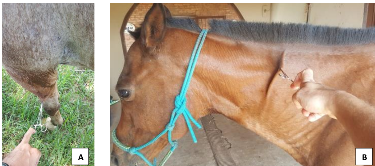
Figure 5. A – Image showing complete skin hypoesthesia/anesthesia in a horse with a non-congenital cervical problem. B – Cervical region with complete anesthesia resulting, in this case, from a congenital lesion.

Another important clinical finding in GI and GII were brachial plexus compressions, muscle atrophies in the anterior limbs (right and left), hyposensitivity of the skin ( Figure 5A ) and cervical muscles ( Figure 5B ) ( May-Davis & Walker, 2015 ).