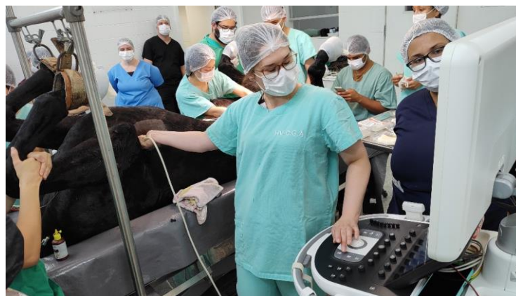
Figure 3. Echocardiography of an equine patient in the large animal surgical center of the HV – UFPR.

The drug of choice for treating hypotension was metaraminol hemitartrate (Aramin®, Cristália, Itapira, SP, Brazil), starting with 1 µg/kg/min and increasing to 2 µg/kg/min and 4 µg/kg/min, as required. Before and after the start of vasoactive infusion, cardiorespiratory and echocardiographic parameters were recorded. Echocardiographic parameters were obtained by transthoracic echocardiography (Affiniti 50®, Philips, Bothell, WA, United States) in the right parasternal window (Figure 3). The infusions were prepared in lactated Ringer's solution, in 60 mL syringes and administered through a DigiPump™ SR8x syringe pump (Digicare Biomedical, United States) for the continuous infusion of dexmedetomidine and UniFusion SP50 (Vet Shenzhen MedRena Biotech, China) for metaraminol infusion.