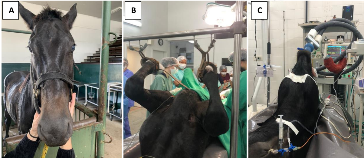
Figure 2. A: Equine patient in the pre-anesthetic evaluation in the amphitheater of the HV – UFPR. B: Equine patient positioned in dorsal decubitus maintained under general anesthesia in the large animal surgical center at HV – UFPR for a closed technical orchiectomy procedure. C: Equine patient in dorsal decubitus maintained under general anesthesia in the HV – UFPR, with recording of vital parameters and invasive pressure.

controlled mode, with a tidal volume of 10 mL/kg, I:E ratio of 1:4, inspiratory time of 2 seconds and maximum inspiratory peak pressure of 20 cmH 2 O. Anesthesia was maintained with isoflurane (Isoflurine®, Cristália, Itapira, SP, Brazil) diluted in oxygen and continuous infusion of dexmedetomidine, 1 µg/kg/h (Dexdomitor, Zoetis, Campinas, SP, Brazil). When there were signs of superficialization of the anesthetic plane, ketamine 0.11 mg/kg (Cetamin, Syntec, Hortolândia, SP, Brazil) and xylazine 0.11 mg/kg (Xylazine 10%, Dechra, Rio de Janeiro, RJ, Brazil) in bolus. In addition, an intratesticular block was performed with 20 mL of 2% lidocaine without vasoconstrictor for each testicle and subcutaneous infiltration of the scrotal skin.